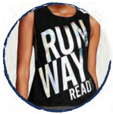
VICTORIA'S SECRET SPORT