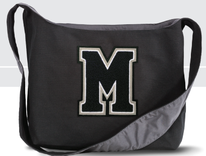
BG405 PORT AUTHORITY® COTTON CANVAS SLING BAG