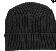
C908 PORT AUTHORITY® WATCH CAP

The classic beanie is new again with oversized rib or cable stitches leading the revival.