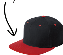
STC19 SPORT-TEK® FLAT BILL SNAPBACK CAP

Design details and luxe fabrics elevate the fan-favorite baseball cap to a style must-have.