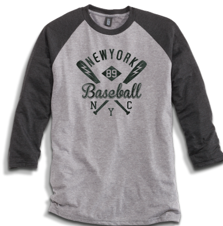
DM136 DISTRICT MADE® PERFECT TRI 3/4-SLEEVE RAGLAN

Baseball tees' contrast sleeves and trims play up essential style details.