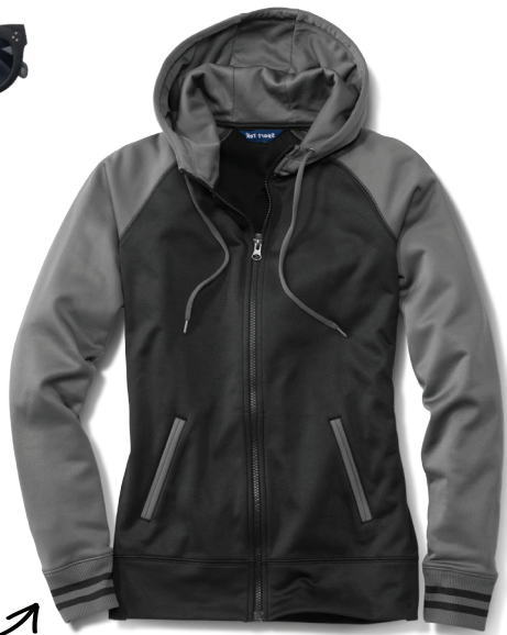
LST236 SPORT-TEK® LADIES SPORT-WICK VARSITY FLEECE FULL-ZIP HOODED JACKET

Sport striping on everything from fleece jackets to cashmere sweaters is an essential varsity detail.