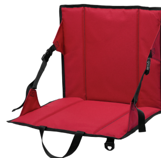
BG601 PORT AUTHORITY® STADIUM SEAT