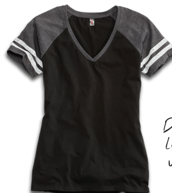
DM476 DISTRICT MADE® LADIES GAME V-NECK TEE

The classic beanie is new again with oversized rib or cable stitches leading the revival.