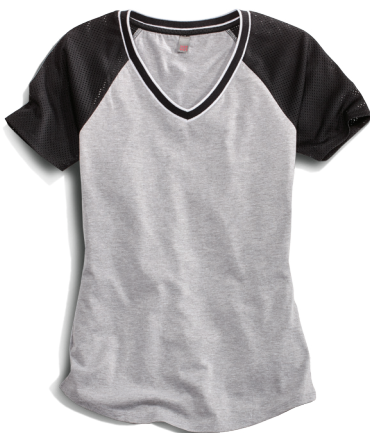
DT276 DISTRICT® JUNIORS MESH SLEEVE V-NECK TEE

Incorporating sports mesh into any garment gives it an active, modern feel.