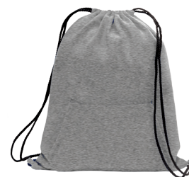
BG614 PORT & COMPANY® SWEATSHIRT CINCH PACK

Denim evolves, incorporating new technical features like stretch or water-resistance.