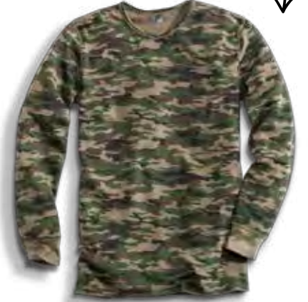
DT118 DISTRICT® YOUNG MENS LONG SLEEVE THERMAL

Thermal Knits with - contemporary camo prints reference popular military themes.