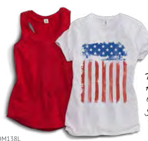
DISTRICT MADE® LADIES PERFECT TRI RACERBACK TANK

DM138L for playful, fresh, Americana styling.