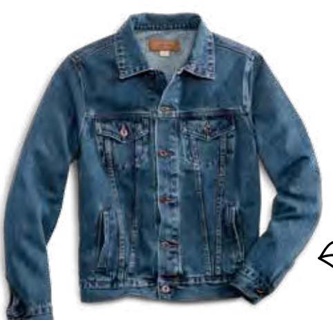
J7620 PORT AUTHORITY® DENIM JACKET

Denim jackets, often called "Trucker Tackets," are Key in retail markets.