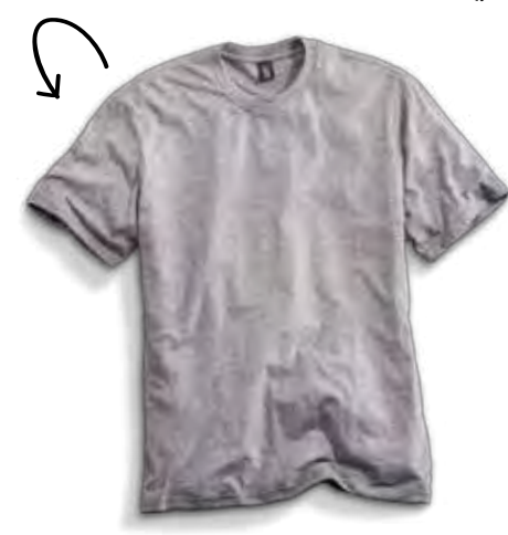
DM130 DISTRICT MADE® MENS PERFECT TRI CREW TEE

Heather tees lend a heritage look with super soft, lightweight Knits leading customer demand.