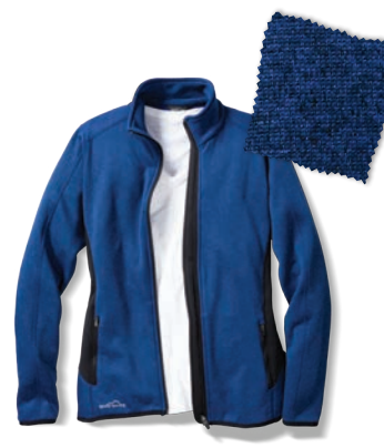
EB239 EDDIE BAUER® LADIES FULL-ZIP HEATHER STRETCH ELEECE JACKET