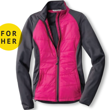
L787 PORT AUTHORITY® LADIES HYBRID SOFT SHELL JACKET