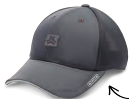
OE654 OGIO ENDURANCE® CIRCUIT CAP