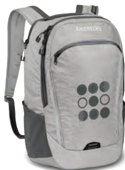
411094 OGIO® SHUTTLE PACK

Ultrasonic, welded mesh textures mix with solid tech fleece for a monochromatic colorblock .