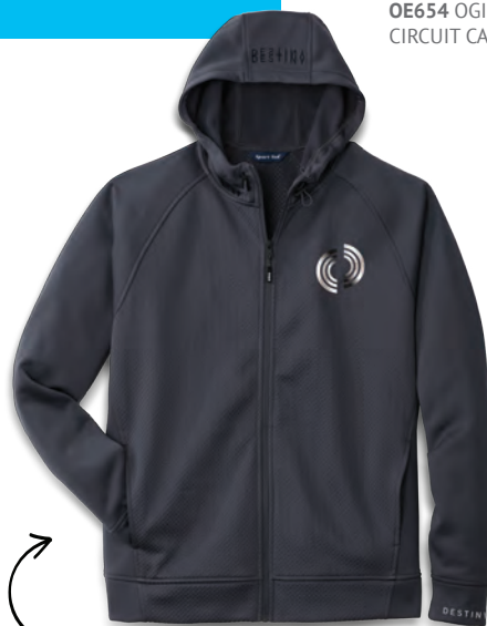
ST295 SPORT-TEK® RIVAL TECH FLEECE FULL ZIP HOODED JACKET