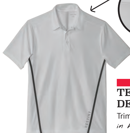
ST620 SPORT-TEK® CONTRAST POSICHARGE® TOUGH POLO™