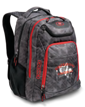
411069 OGIO® EXCELSIOR PACK

Photoreal prints allow for DIY expression with collage graphics.