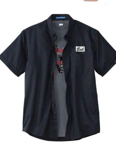
$664 PORT AUTHORITY® SHORT SLEEVE SUPERPRO™ TWILL SHIRT