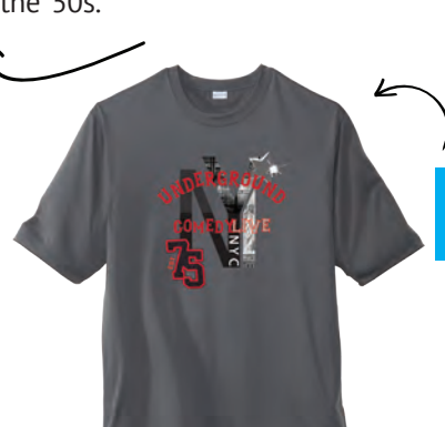
ST320 SPORT-TEK® POSICHARGE® TOUGH TEE™