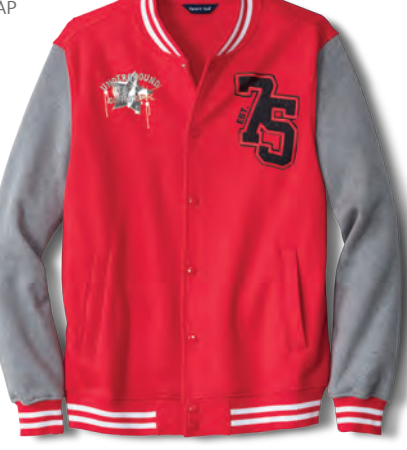
ST270 SPORT-TEK® FLEECE LETTERMAN JACKET

Mini skirts and Chelsea boots are fresh fashion finds with a nostalgic twist.