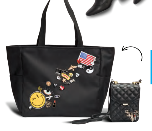
BG410 PORT AUTHORITY® ESSENTIAL ZIP TOTE

Classic letterman jackets are worn oversized and decorated with both traditional and unconventional patches.