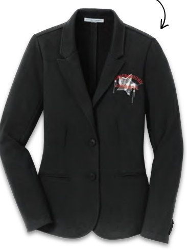
LM2000 PORT AUTHORITY® KNIT BLAZER

structure to command attention and enough fashion to be cool at work.