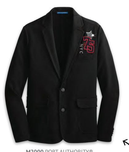
M2000 PORT AUTHORITY®