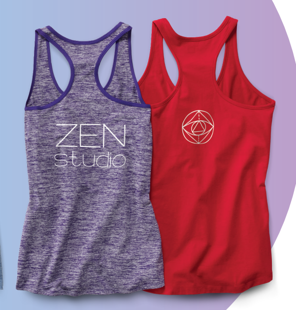
LST396 SPORT-TEK® LADIES POSICHARGE® ELECTRIC HEATHER RACERBACK TANK